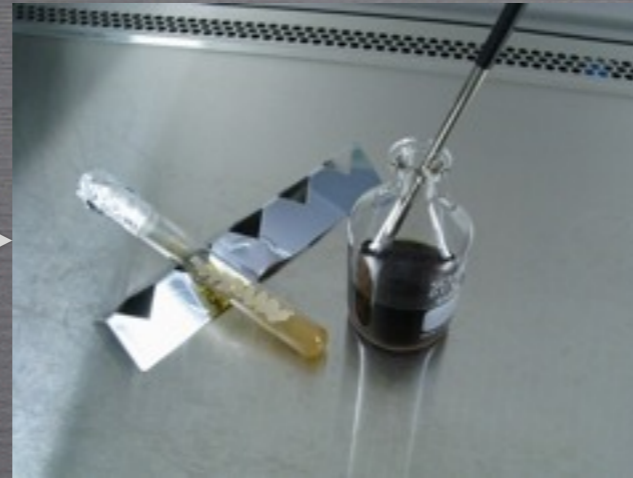
100 - 200 ML STERILE WORT AT AMBIENT TEMP